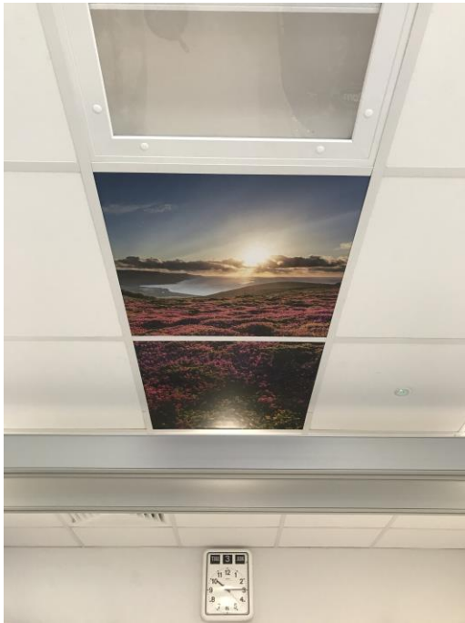
Neville Stanikk's photograph in ICU Pod 3

Art for Life has installed photographs by South West photographer Neville Stanikk above the patients' beds in the newly built Pod 3. It is hoped that the photographs will provide comfort and distraction for patients and their families.