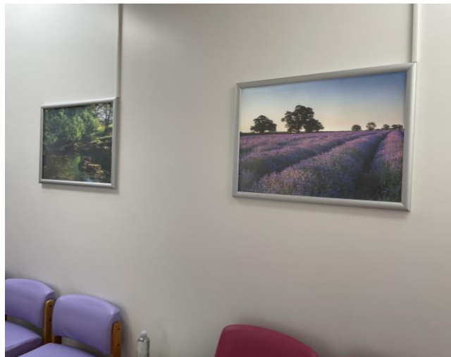
Neville Stanikk's photographs in the staff area

We were asked by the team on Breastcare to install some artwork in one of their imaging rooms and in the rather dull and dark staff rest area. We purchased work from Leo Davey for the patient imaging area and installed 2 lightboxes with colourful photographs by Neville Stanikk in the staff rest room.