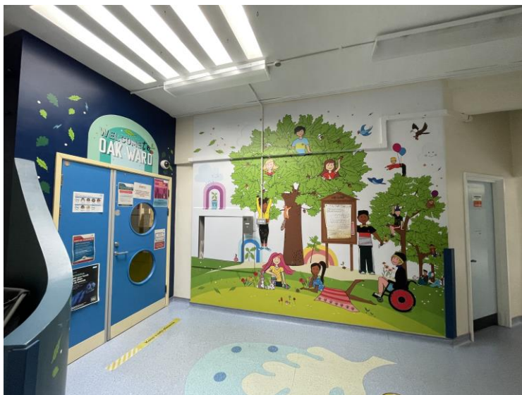
Lucy Hobbs' design on oak entrance

Over the last six months we have completed a number of projects in consultation with the team on the Unit. Working with designer Lucy Hobbs we have completed and installed a series of designs that brighten up and improve the environment as you enter Oak ward. The designs are aimed at the broad age range of children and young people that use the Unit.