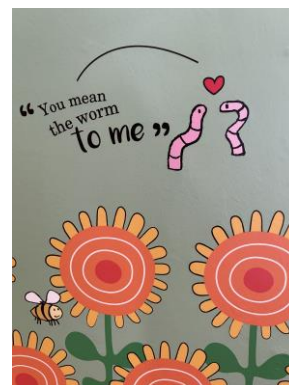
Detail of Cubicle 3 design

The Unit was kindly donated funds by a patient's family. They were keen that their money go to improving the environment of Cubicle 3 on Oak ward where they had spent time. Lucy took their ideas and developed a large design for the wall of the room that has an interactive element – a magnetic area that patients and their families can enjoy playing with.