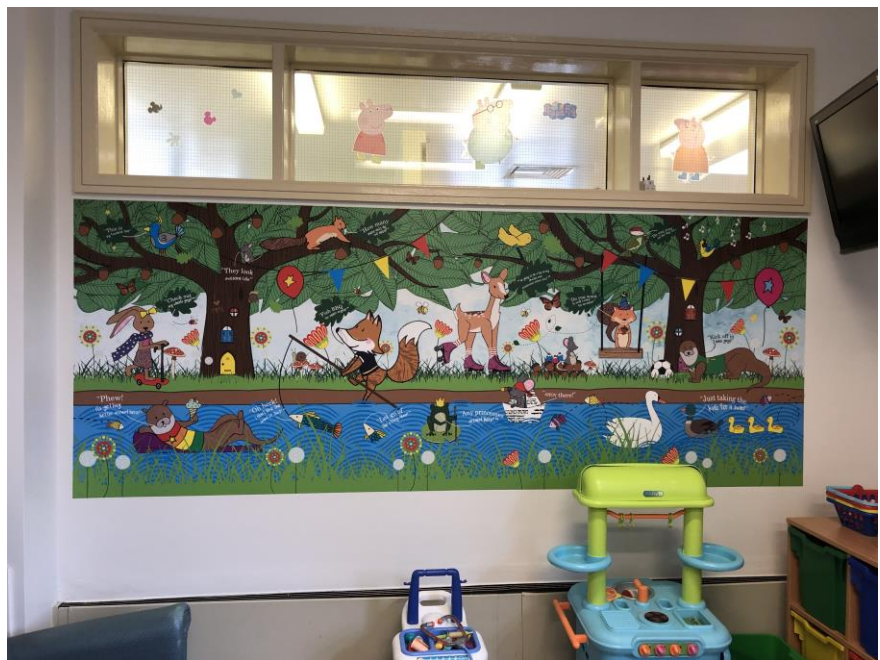
Lucy Hobbs riverside design

Art for Life has been working with the Children's Unit to support the refurbishment of the children's area in the Day Surgery Unit. Artist Lucy Hobbs created some wonderful colourful designs for the walls of the play area and bed bays. The work was installed once the whole area had been repainted and new flooring and lighting installed.