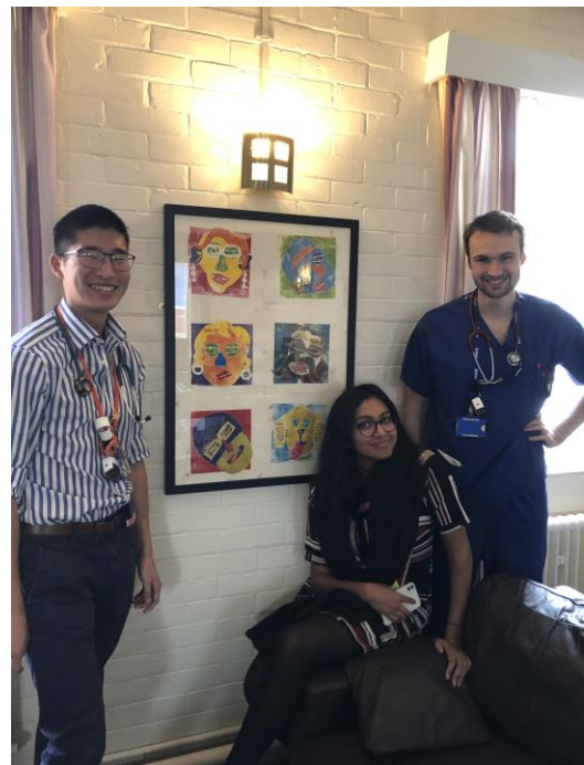
Prints installed in the Mess