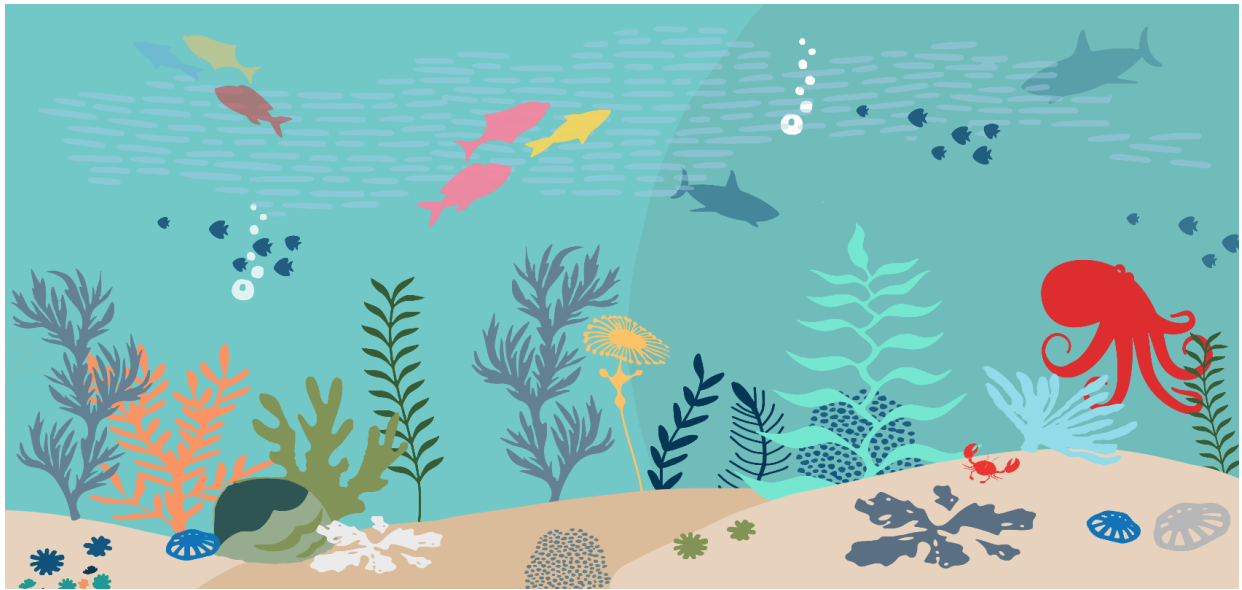
Design work by Chloe Harper

Art for Life is busy embarking on a number of new projects that include working on: