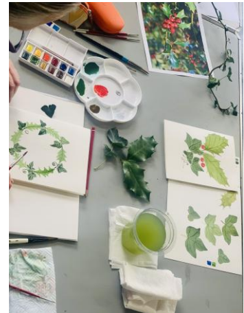
Holly Foskett Barnes watercolours

Running up to the festive season we have 4 staff wellbeing workshops being delivered across the 2 Acute sites, Bridgwater and Wincanton Community Hospitals. Double Elephant, an Exeter based print workshop will be delivering Christmas Card printing sessions and Holly Foskett Barnes will be using watercolours to support staff to make paper wreaths.