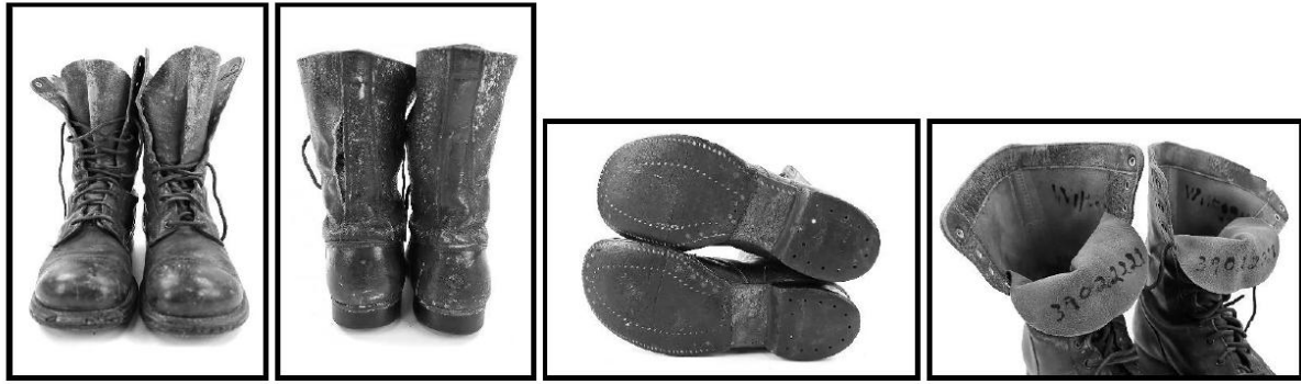
Four views of boots belonging to L. J. Wiltgen