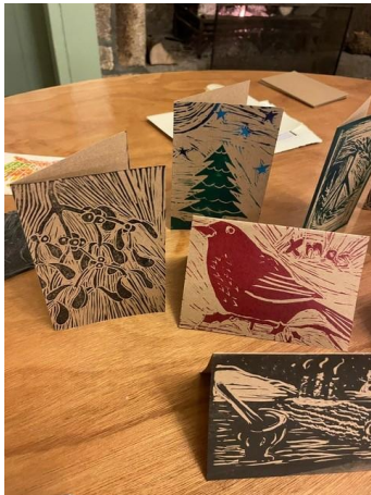
Double Elephant Christmas cards

Running up to the festive season we have 4 staff wellbeing workshops being delivered across the 2 Acute sites, Bridgwater and Wincanton Community Hospitals. Double Elephant, an Exeter based print workshop will be delivering Christmas Card printing sessions and Holly Foskett Barnes will be using watercolours to support staff to make paper wreaths.